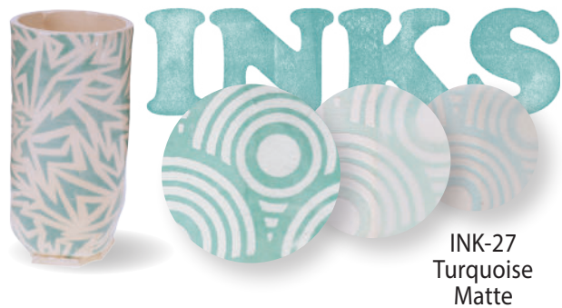
INK-27 Turquoise Matte