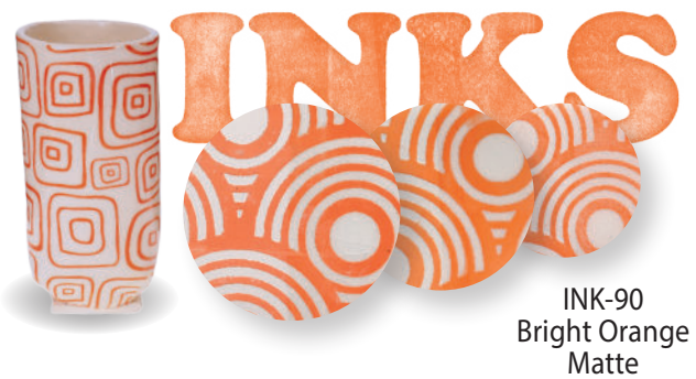
INK-90 Bright Orange Matte