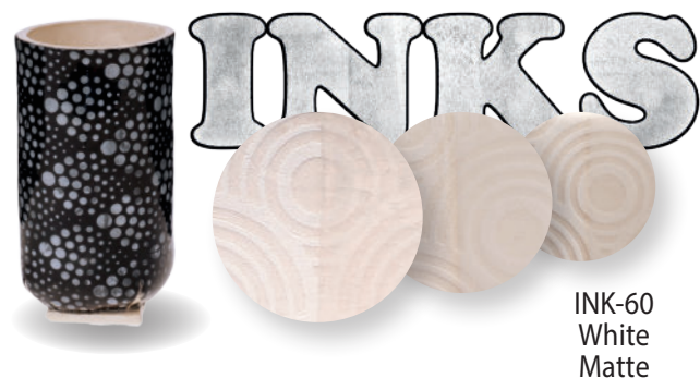
INK-60 White Matte