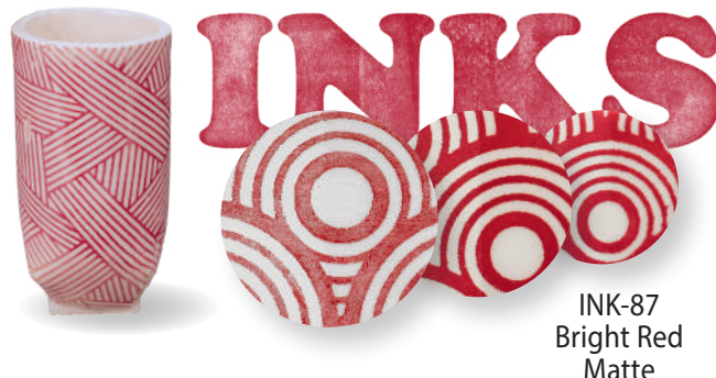
INK-87 Bright Red Matte