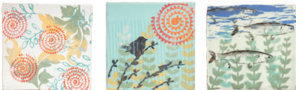
HF-11 White SM-24 Seafoam C-40 Aqua

We recommend putting a base layer of glaze onto your bisqueware before printing with the Inks for best results. You can use a variety of different glazes as a base: