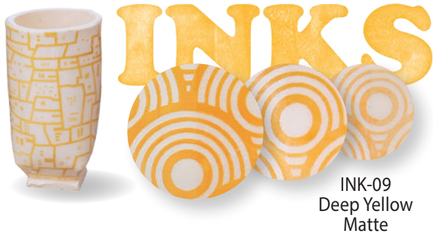
INK-09 Deep Yellow Matte