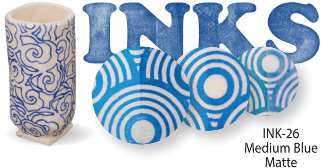
INK-26 Medium Blue Matte