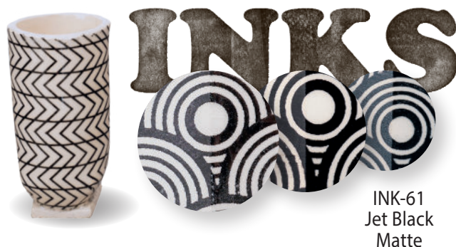
INK-61 Jet Black Matte