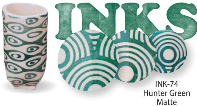
INK-74 Hunter Green Matte